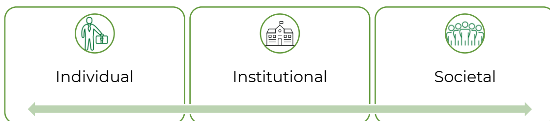
Diagram 1: Multi-level Training Approach

The Capacity Development function of the PPP Directorate provides multilevel capacity building as depicted here below: