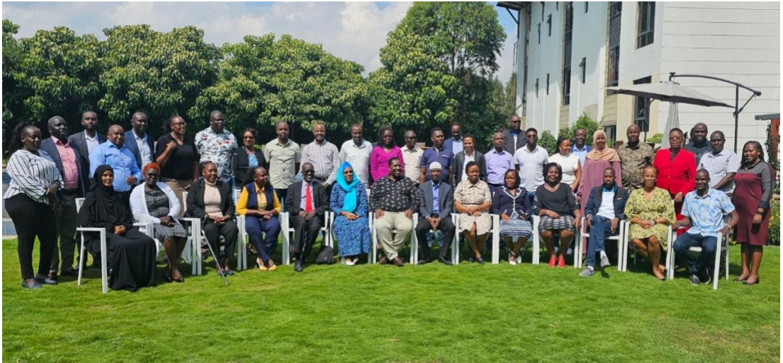
CEC Members responsible for Trade and Investment during the training on PPP as a means of activating the County Aggregation and Industrial Parks initiative. The training was held in Naivasha in the month of June 2024.

Further, the Directorate held training programmes in collaboration with institutions of higher learning (Kenya School of Government, University of Nairobi and Strathmore University).